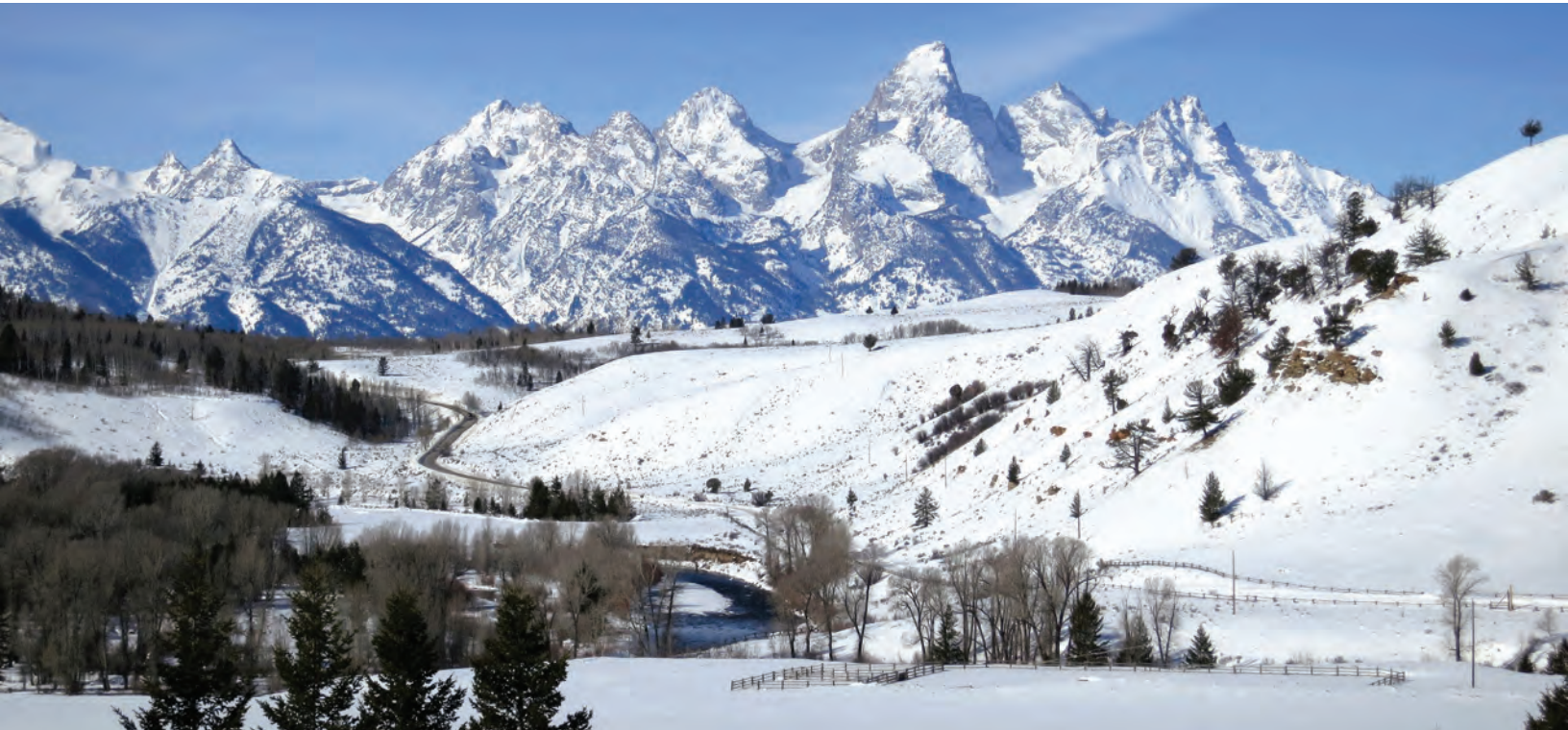
EXHIBIT AND SUPPORT PROSPECTUS