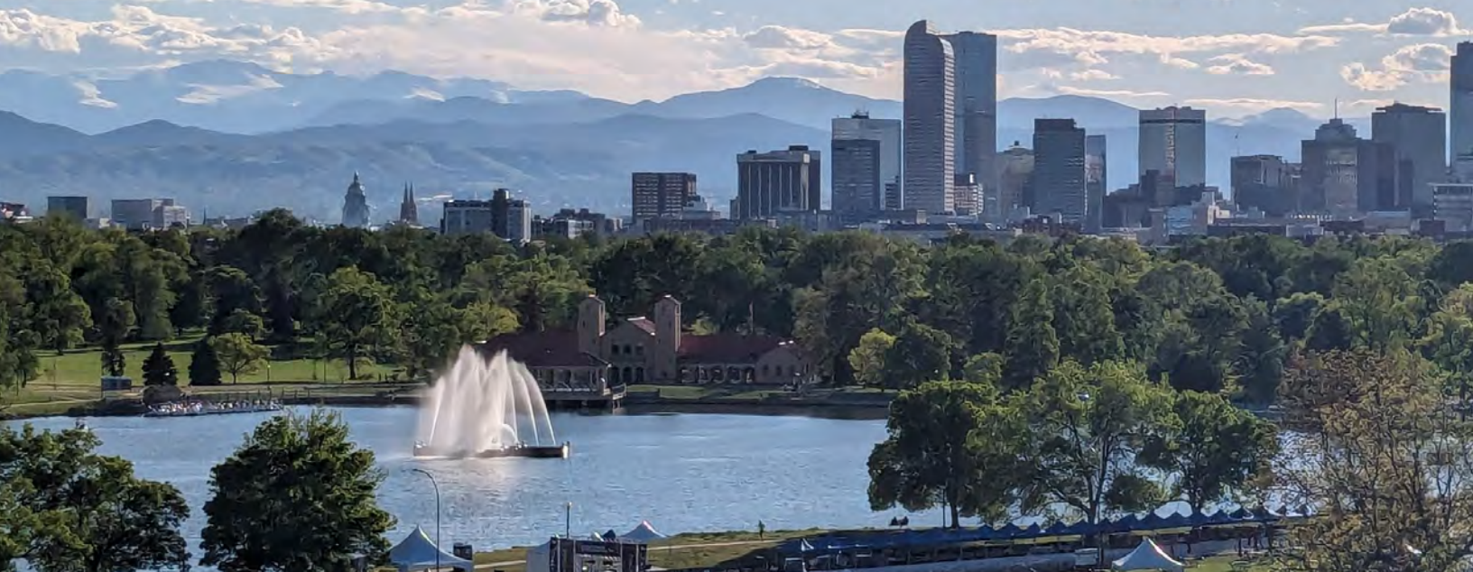
EXHIBIT AND SUPPORT PROSPECTUS