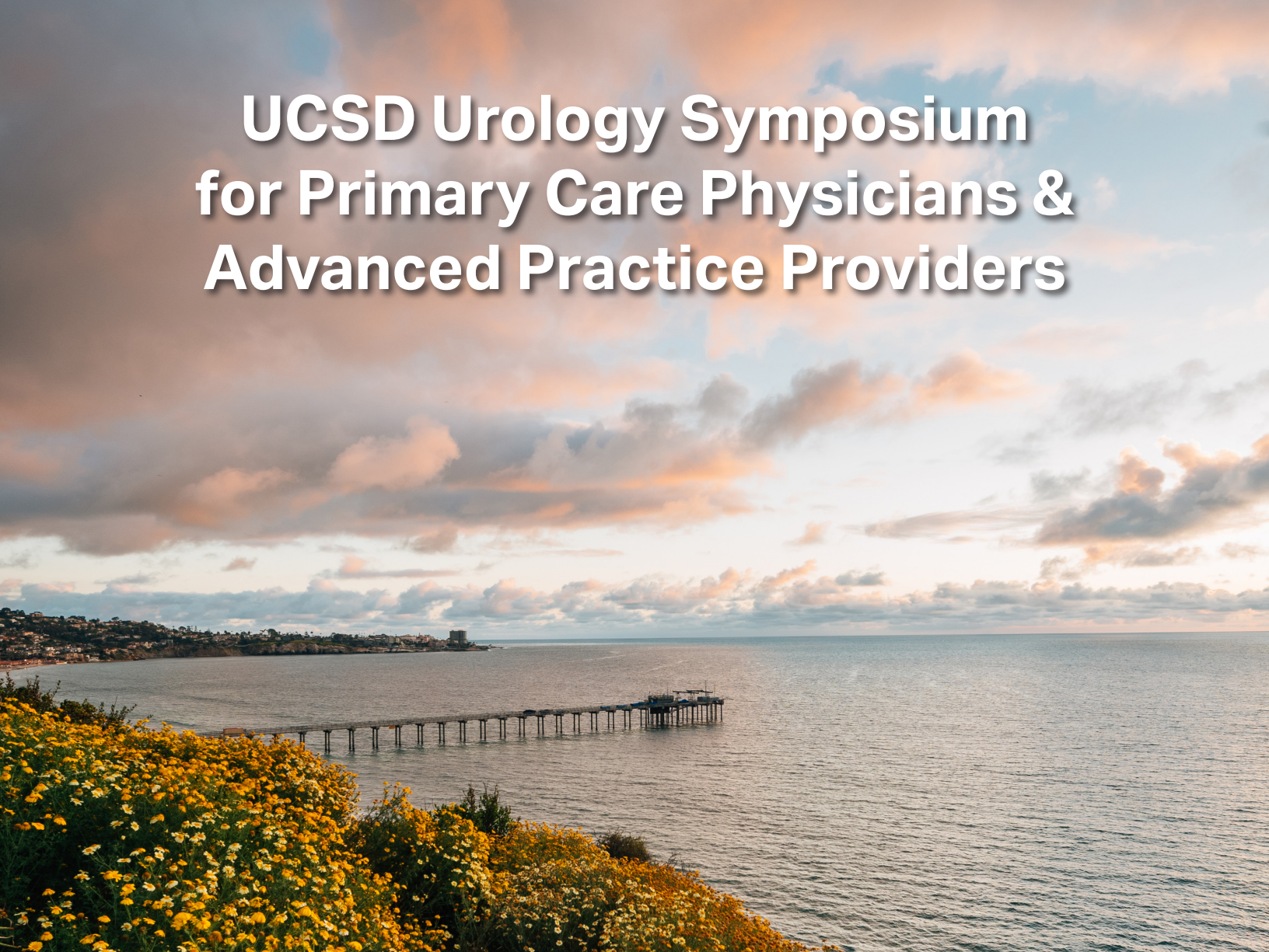
EXHIBIT AND SUPPORT PROSPECTUS